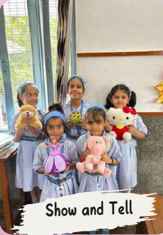
Show and Tell