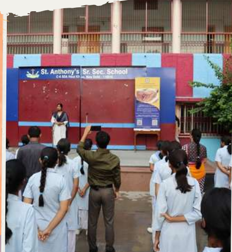
CANCER AWARENESS SESSION

त्योहारों के रंगों में रंगा यह मास , राष्ट्रप्रेम और देशभक्ति का एहसास । भाई - बहन के रिश्ते का अनूठा अंदाज, माखन - मिश्री की मिठास। इन त्योहारों के अनुपम सौंदर्य का है यह सार, खुशियाँ संग बाँटने के विविध प्रकार। सेंट क्लेयर'स फीस्ट , जन्माष्टमी, रक्षाबंधन से गूँजे कैंपस में उत्सव की झंकार, प्रतिस्पर्धा और इंटर स्कूल कंपटीशन से आए हर कौशल में निखार । झूम उठते हैं सब जैसे ही कटे फसल, आपस में बाँट कर दुगुनी हो खुशियाँ, AUGUST का है यही मर्म असल।