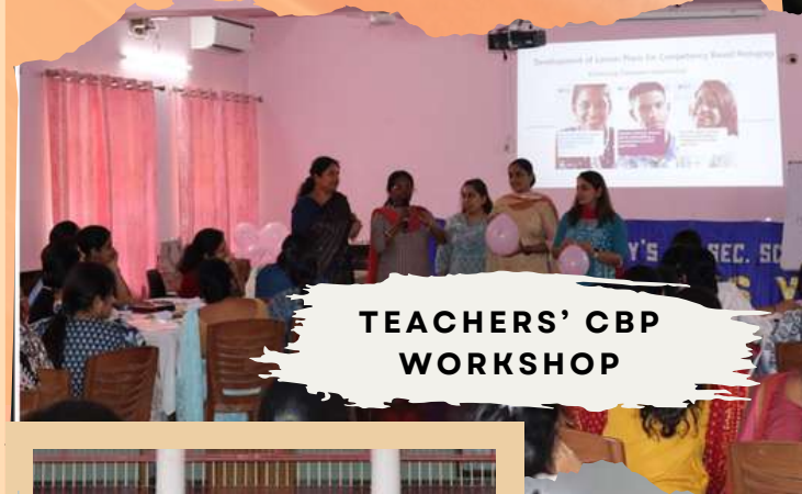
TEACHERS' CBP WORKSHOP