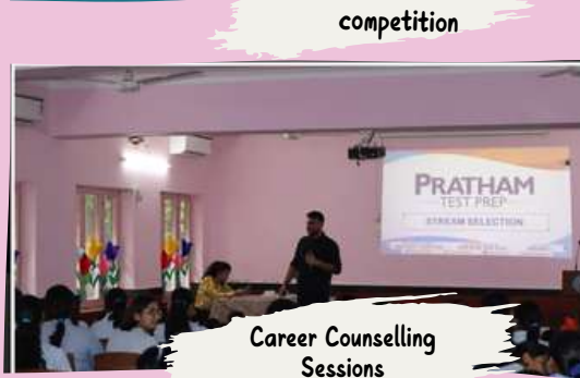
Career Counselling Sessions