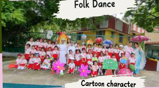
Cartoon character competition