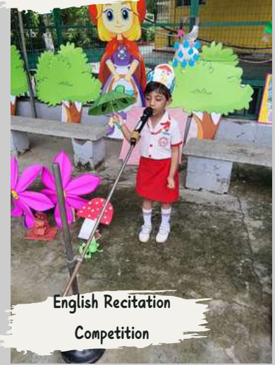
English Recitation Competition