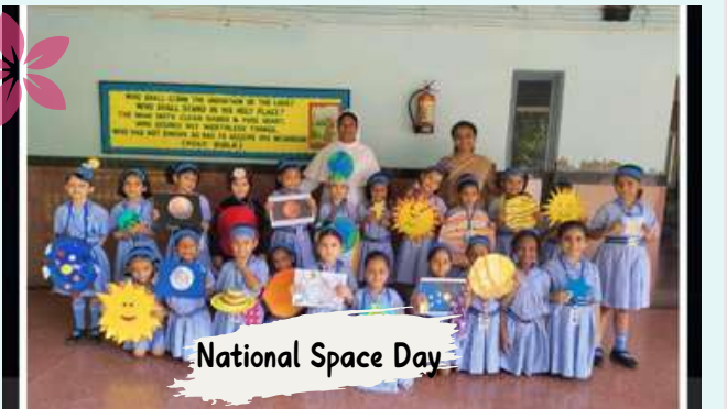
National Space Day