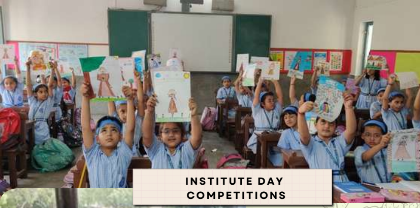
INSTITUTE DAY COMPETITIONS