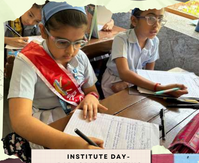
INSTITUTE DAY- PARAGRAPH WRITING

नए सत्र की पहली परीक्षा की जोरों -शोरों से चलती तैयारी पूरे कैंपस में जब हँसी गूँजती है हमारी, तो महक कर बोल पड़ती है फूलों की क्यारी अब आई है MAY की बारी।