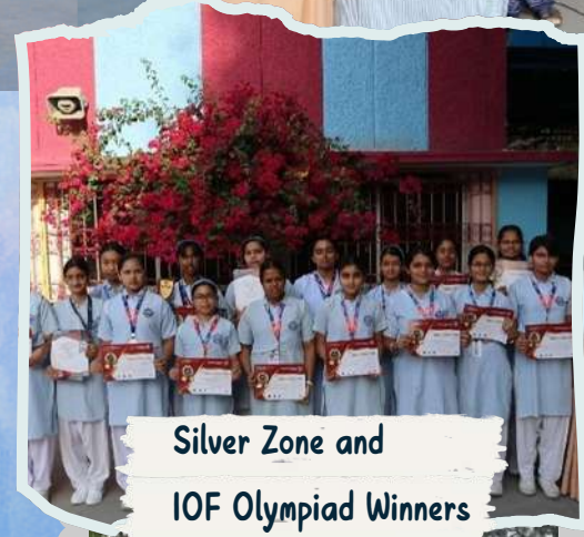
Silver Zone and IOF Olympiad Winners

प्रतिभा की किरणों की मधुमाया में बैठी बोध वृक्ष की छाया में। होंगे नए मंज़र, नए नज़ारे, मिलेगी नई मंज़िल हवा भी गुनगुना रही है देखो आया APRIL