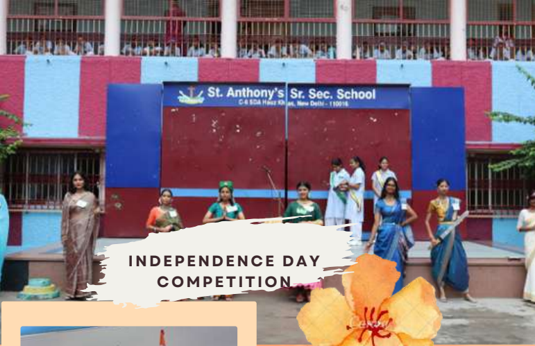
INDEPENDENCE DAY COMPETITION