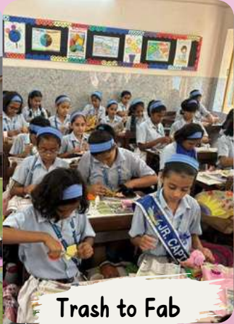
Trash to Fab