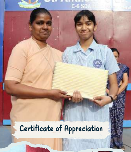
Certificate of Appreciation