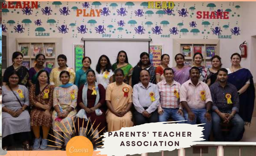
PARENTS' TEACHER ASSOCIATION