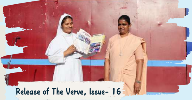
Release of The Verve, Issue- 16